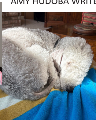
CHIPPER IN HIS RETIREMENT.