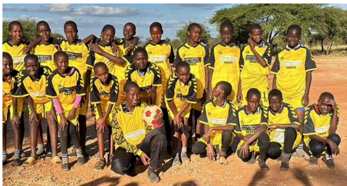
ONE OF THE MAASAI TEAMS IN THEIR NEW UNIFORMS

This June, the U.S. “Delivering Dignity” team will get to see the effects of the competition, celebrate with the girls, and present the “official trophy” to the best school team. Next year, the plan is to expand the number of schools participating.