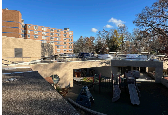
PICTURED IS THE SOUTH END OF CHPC’S “LEARNING CENTER.” THE REPLACED ROOF AREA IS SURROUNDED BY TEMPORARY WOODEN SAFETY RAILINGS.

The new roof is a more durable design with three layers of roofing: