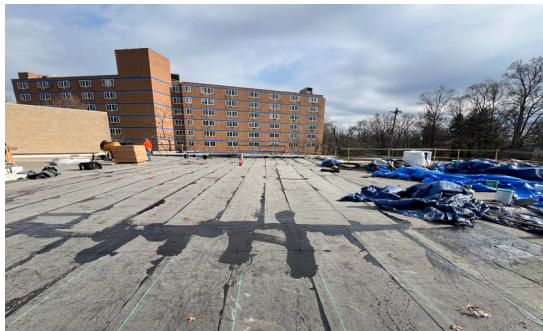
BELOW, THE 6300 FT. 2 FLAT ROOF’S COVERING WAS TOTALLY REPLACED. PICTURED BELOW IS THE ROOF’S CONCRETE BASE EXPOSED.