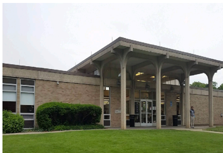
COLLEGE HILL PUBLIC LIBRARY

This summer, CHPC Family Ministries launched "9 Weeks of Summer," a fun and faith-filled outreach series that was a collaboration with the College Hill Public Library , Cherish Your Children Childcare Center (across the street from CHPC in the College Hill Plaza), and two other child care services. Thanks to CHPC's Covenant Partner's generosity young people in the College Hill area had meaningful and joy-filled experience each Thursday from June 5 to August 7!