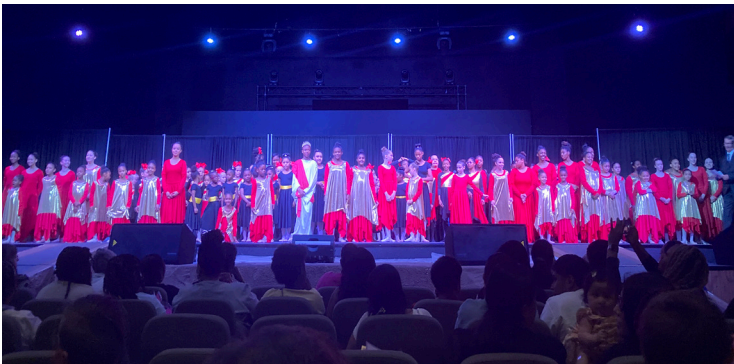
MAY 10, 2025: THE GLITTERING CAST OF THE 2025 RECITAL OF THE CITY GOSPEL MISSION'S PRINCESSES BALLET GROUPS WITH CHPC'S JESUS UNIVERSITY BALLET IN THE FRONT ROW.

In closing, the greatest blessings of our worship journey together are the girls who now confess Jesus as their Lord and Savior and dance to the Glory of God the Father. As the Director of J.U., I appreciate the eternal significance of what God is doing through ballet. I am thankful to my husband and others who have signed up to embark on this urban mission—to carry the gospel around a ten-mile radius, serving children who may not have the funds to experience the benefit of the Arts. They bring their tattered smiles to CHPC to practice on Fridays/Saturdays and grow in their faith and grace through Jesus University. PTL!