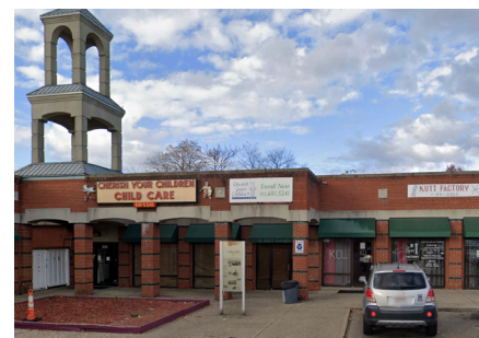
CHERISH YOUR CHILDREN CHILDCARE Center