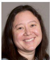
BY JINDA BOWERMAN, Deacon & Nurse

Sun. Sept 7 - Orientation at CHPC, 2nd Floor Learning Center; Tues., Sept. 9 It's the First Day to Tutor!