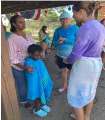
Our annual June Staff Training focuses on relationship-building

Each teacher, swimmer, and family is unique. However, the ability to build warm, caring relationships — even with young, non-verbal, fearful children—can be learned.