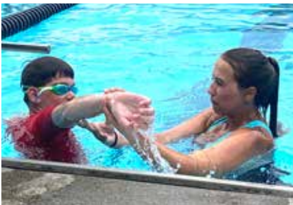
(LEFT) AT UPPER SKILL LEVELS, TEACHERS EMPHASIZE “THE LITTLE THINGS THAT MAKE A BIG DIFFERENCE” LIKE HAND/ARM POSITIONS.

To apply for Swim Ministry Staff, a person must be working at American Red Cross (ARC) skill Level 4 and be willing to lovingly interact with children, teens, and adults. Staff are paid to take lessons until they complete ARC Level 6. The ministry also pays for staff to take extra training in Adaptive Aquatics, or as a Life Guard, or a Water Safety Instructor. Experienced teachers learn to mentor, manage, train, and coach other staff. Serving swimmers’ needs stirs up everyone’s creative gifts. The daily staff meetings before and after lessons allow teachers to learn from each other by sharing teaching ideas, “secrets of success,” “problems I’m having,” and “a good surprise I had.” Then, we pray for various aspects of the lessons. The result is a healthy interdependence among the staff and an infectious spirit of fun.