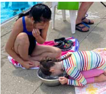
DEMO OF A SWIMMER PRACTICING SIDE BREATHING AND HUMMING IN A LARGE PASTA DISH FILLED WITH WATER. STUDENTS PRACTICE THIS FOR HOMEWORK.