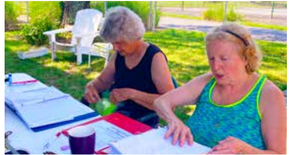
OUR "WELCOME TEAM" AND BUSINESS MANAGERS SERVE THE FAMILIES OF SWIMMERS AND THE STAFF. WE ARE SO THANKFUL FOR THEIR SERVICE.