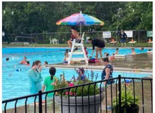
OUR GOD REIGNS...AND RAINS TOO.