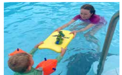
(ABOVE) THE GREEN FROG FAMILY ON THE KICKBOARD REMINDS THE SWIMMER TO KEEP THE BOARD FLAT WHEN PRACTICING.