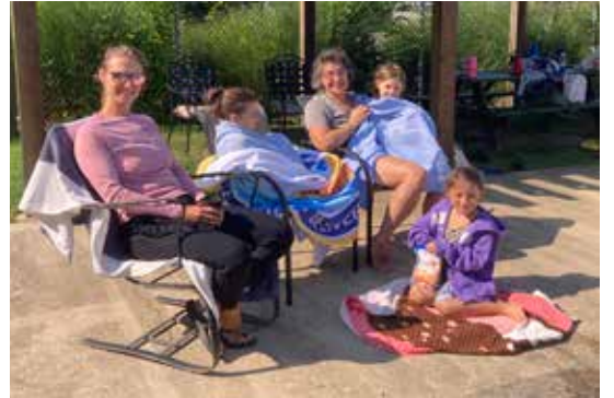
ADULT LEADERS OF OUR CHILD-CARE TEAM MAKES IT POSSIBLE FOR "MOMS" TO TEACH KNOWING THAT THEIR CHILDREN ARE SAFE AND LEARNING TO SWIM .