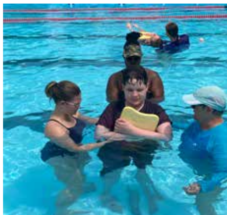
SPECIAL TRAINING IN ADAPTIVE AQUATICS (ABOVE & RIGHT) ENABLES THE STAFF TO MEET SWIMMER NEEDS IN NEW WAYS TO BUILD TRUST AND SWIMMER CONFIDENCE.