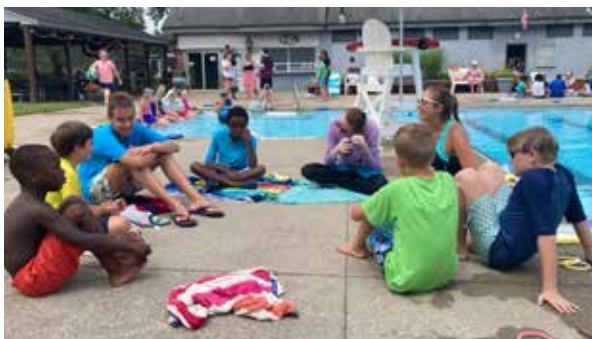
(RIGHT) THE GRANDFATHER TAUGHT IN 1984- 1997 AND THE MOM (BURGANDY SHIRT) IN THE EARLY 1990's. THE REST HAVE BEEN STUDENTS INCLUDING THE 7-YEAR-OLD. THEY HAVE QUITE A COLLECTION OF GREEN FROG CARDS.