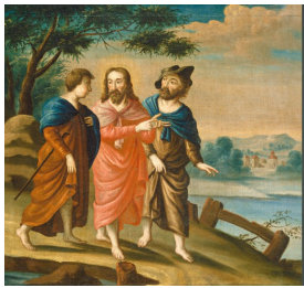
Christ on the Road to Emmaus