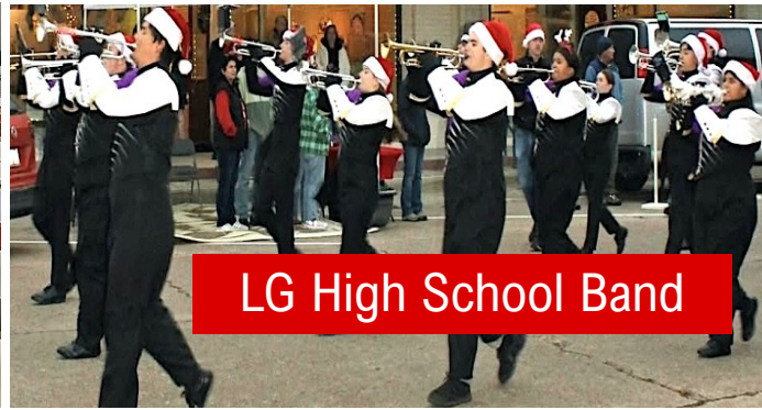
LG High School Band

For the last 2 years, our church has had the opportunity of participating in the City of La Grange's annual Christmas event of Schmeckenfest. Many of our members participate with other groups also. We hand out about 150 Christmas coffee mugs, cookies and information about New Life Methodist Church. Our members and others are so kind to make about 1200 cookies each year to place in the mugs and cookie bags to hand out to 100's of attendees. There is a wassail contest that many groups participate in. Santa and Mrs. Claus arrive at the end of a parade. There are food vendors, kid's activities, shopping and all around fun!