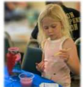
Rock painting with the kids