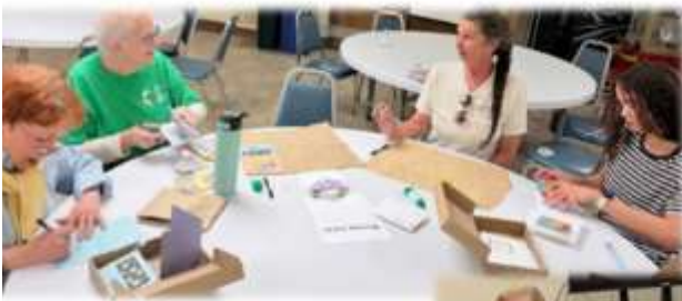
Greeting Card Ministry